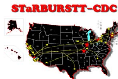
Internet connectivity map of the STaRBURSTT CyberDiffraction Consortium. Red stars denote core node facilities.

Conceived in 1992 and established in 1994, CMoIS was the first facility of its kind at a Predominantly Undergraduate Institution (PUI), dedicated to molecular structure determination and analysis using X-ray diffraction and computational methods. The high performance computational facilities went online to the